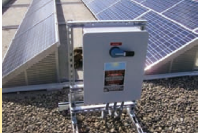
A solar installation with roof rock ballasting