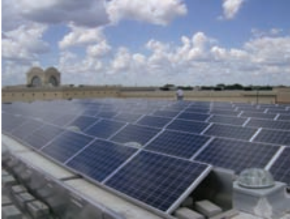
A solar installation with concrete block ballasting

To get maximum energy, solar panels should be installed pointing toward the sun with a minimum of a 10-degree angle. Wind load and roof weight distribution requirements must be carefully assessed. The panels can be either attached directly to the roof with well-sealed fasteners; or to avoid roof penetrations all together, can also be held down with weighted "ballasts"—either concrete block or roof rock.